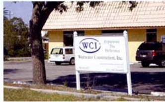
Churchill's Furniture Gallery

1 West from U.S. 301 is Churchill's Furniture Gallery on the NE corner of Fruitville and Lemon Avenue. Recently acquired by developer WCI, this property is slated to become home to a $19 million, five-story, 100,000 sq. ft. office and bank space.