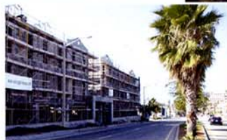
New Fruitville Road Offices

3 Just West are sophisticated, new office buildings. Located East of Coconut Avenue on the South side of Fruitville, the two-story office project features 30,000 sq. ft. and is scheduled to open for business early this year.